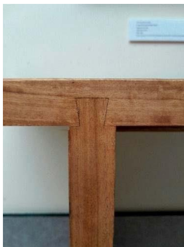
Dovetail detail for table on public display.

For further information including intake forms please contact: