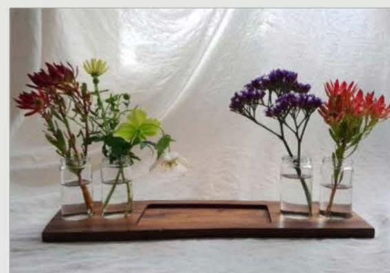
Work created for online exhibition 'The 900 jars project.'