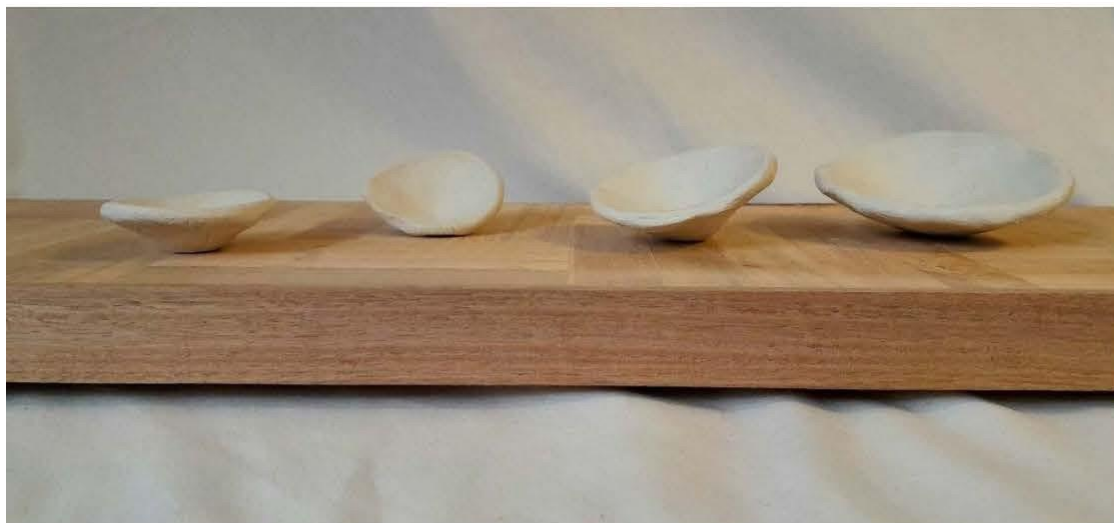
Participant work in native timber and clay

An exciting new opportunity where people create and be inspired